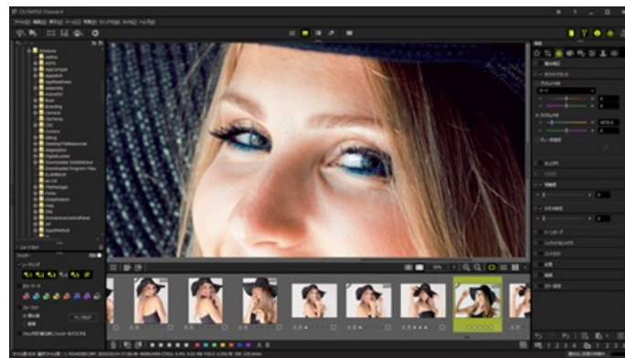
Olympus Workspace Image Editing Software