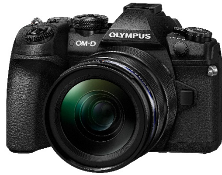
OM-D E-M1 Mark II + M.Zuiko Digital ED 12-40mm F2.8 PRO