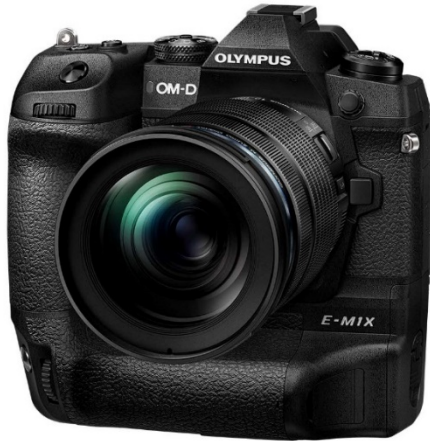
OM-D E-M1X + M.Zuiko Digital ED 12-100mm F4.0 IS PRO